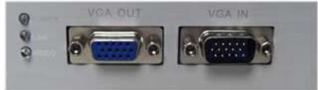
Rear of sender