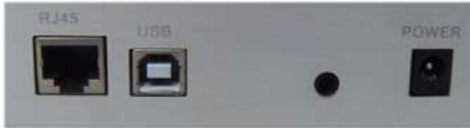
Front of sender